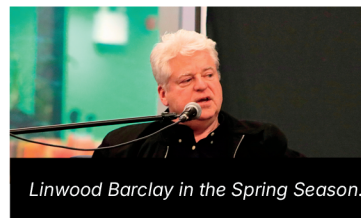
Linwood Barclay in the Spring Season.