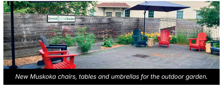
New Muskoka chairs, tables and umbrellas for the outdoor garden.