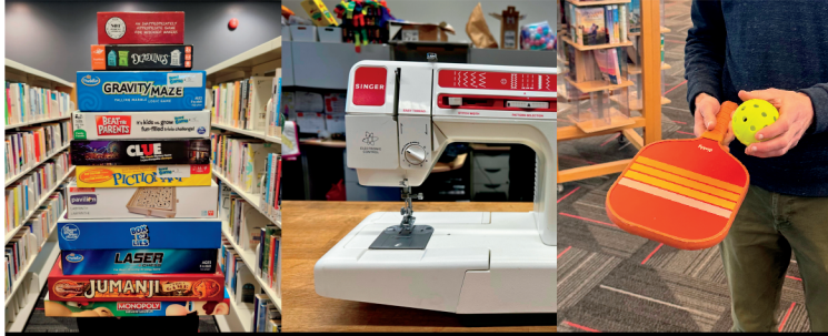
Board Game Collection, Singer Sewing Machine, and Pickleball set.

We launched new Library of Things additions, such as 100+ board games and puzzles, a sewing machine, and pickleball sets.