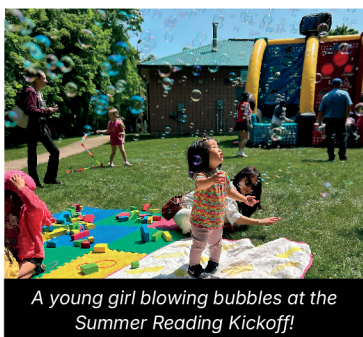
A young girl blowing bubbles at the Summer Reading Kickoff!